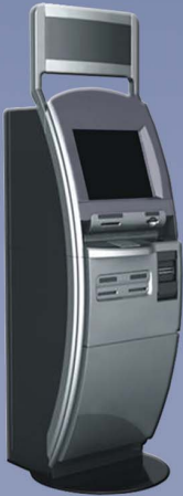
IT-S03 Ticketing Kiosk with passport reader and boarding card printer.