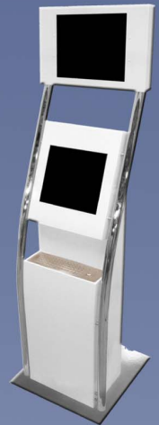
IT-S02 Public area kiosk with advertising screen