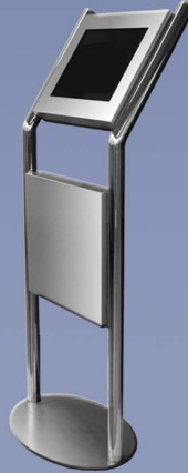
IT-S04 Public area kiosk. Understated design.