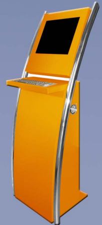
IT-S05 Public area kiosk with keyboard.