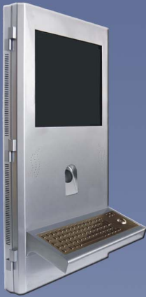
IT-W01 Wall Mount With Stainless Keyboard