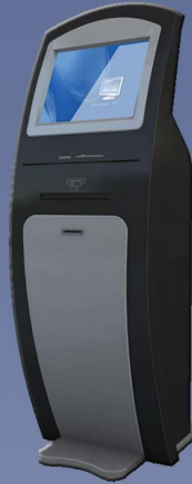
IT-S01 Standard kiosk with magnetic swipe card reader